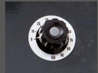
With speed control