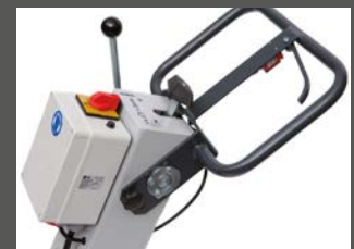
Quick drum lower/lifting