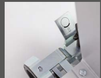
Mechanical brake system